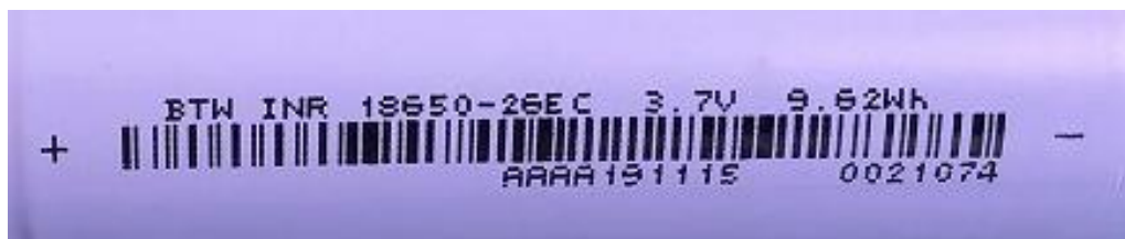
Figure 3 Cell label