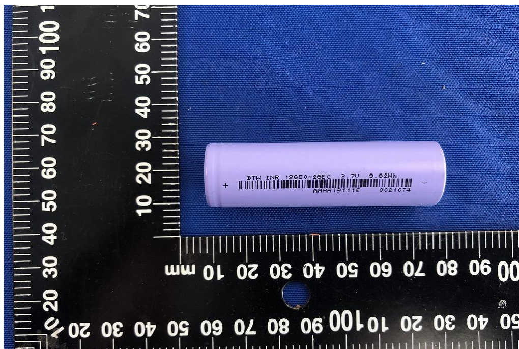
Figure 1 Side view of cell

锂离子电芯 / Lithium-ion Rechargeable Cell (3.7V, 2600mAh, 9.62Wh)