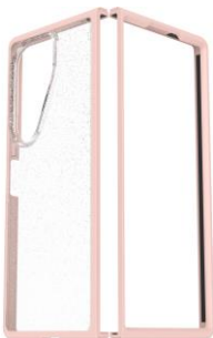
Prima Ballerina 77-95811 (Retail) 840304766284