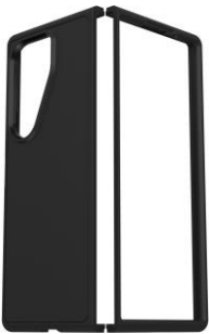
Black 77-95809 (Retail) 840304766260