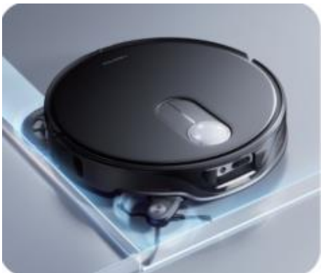
FlexiArm Design Side Brush