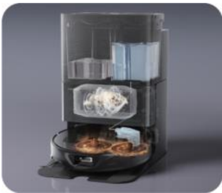
Multifunctional Self-Cleaning Dock