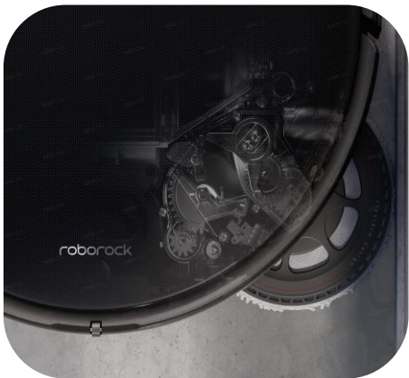
FlexiArm Design Side Mop