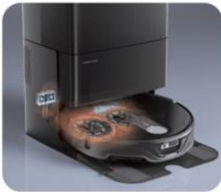
Intelligent Dirt Detection