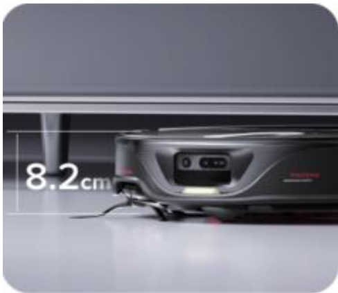
Ultra-Thin 8.2 cm Body