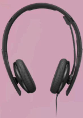
Lenovo Wired VoIP Headset (Teams) 4XD1M45626