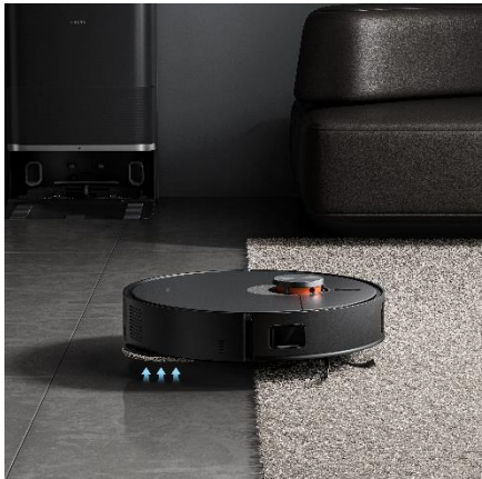
Auto carpet detection & Auto-lifting mop pads