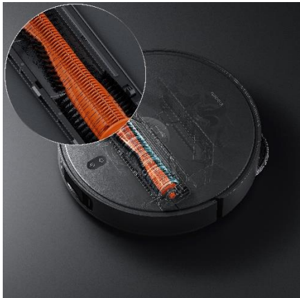
Anti-tangle hair-cutting brush