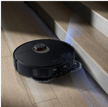
Extendable mop arm