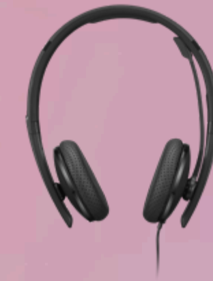
Lenovo Wired VoIP Headset (Teams) 4XD1M45626